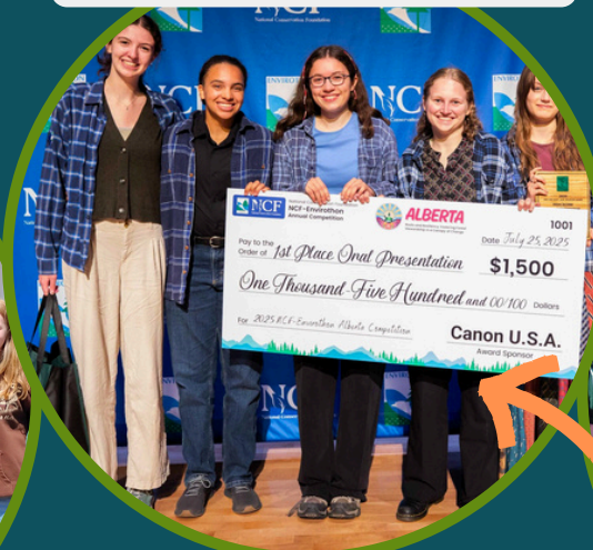
1st Place Minnetonka High School

Team Minnetonka won 1 st place for Oral Presentation and 8 th place overall at the 2025 National Envirothon!