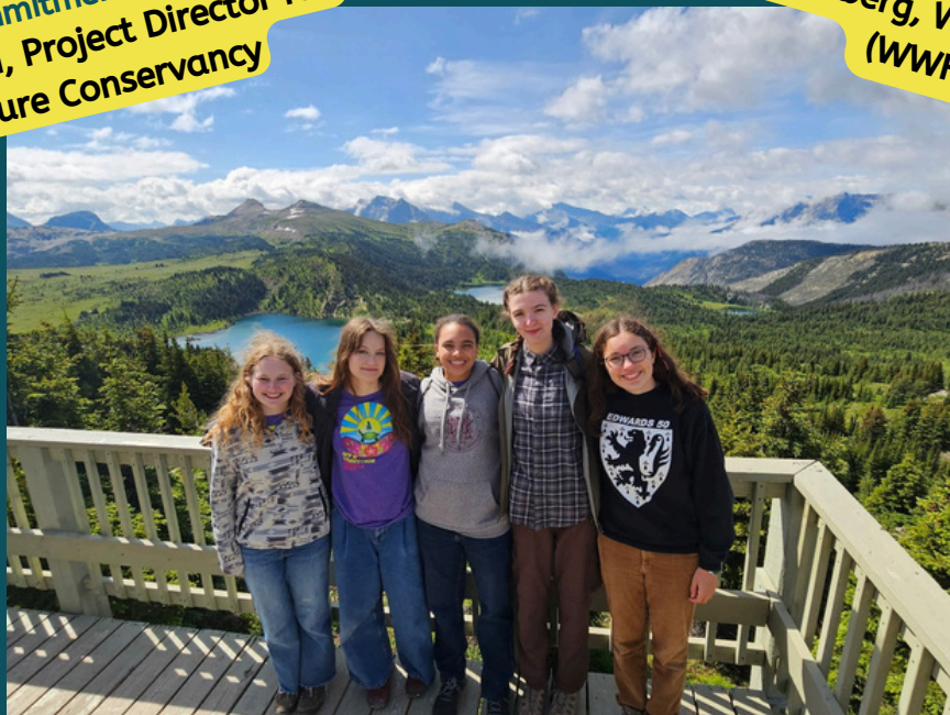
Team Minnetonka at the 2025 National Envirothon, Alberta, Canada.