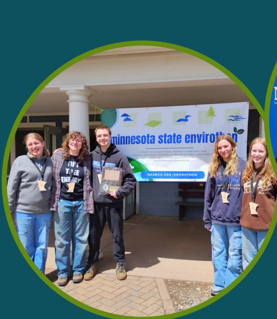
2nd Place Hopkins High School

Nearly 2,000 students participated in eight area Envirothon's across Minnesota in 2025!