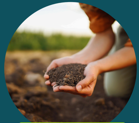
SOILS & LAND USE