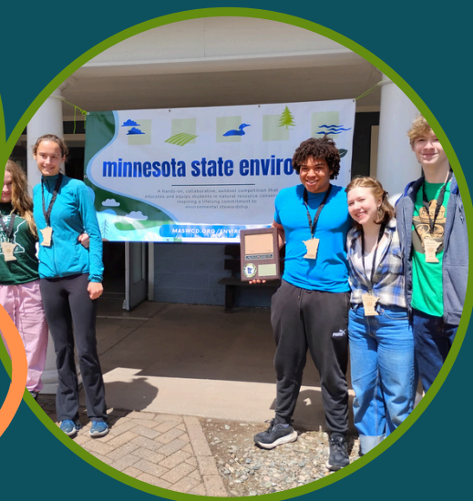
3rd Place Hopkins High School

Team Minnetonka won 1 st place for Oral Presentation and 8 th place overall at the 2025 National Envirothon!