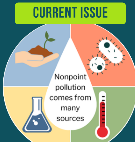
NONPOINT SOURCE POLLUTION