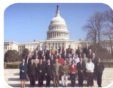
above: the 2007-2008 participants posing for a photo at the U.S. Capitol.