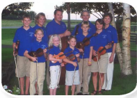
The Generation Strings